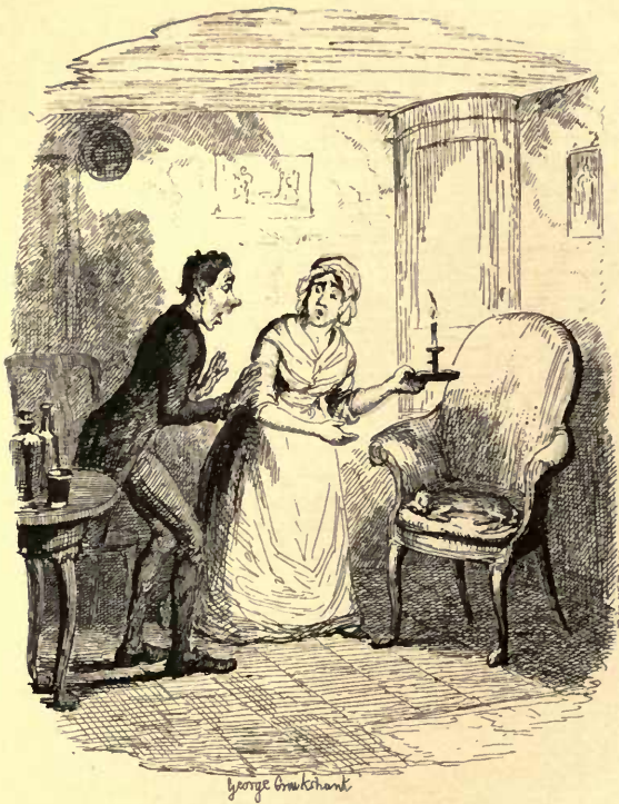
Nurse shewing the Dead Cat on the Chair.